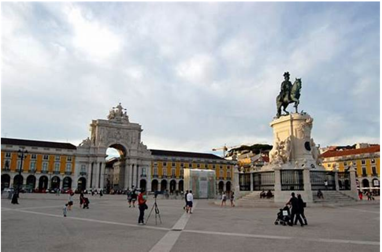
The grand Praça do Comércio in the Baixa district