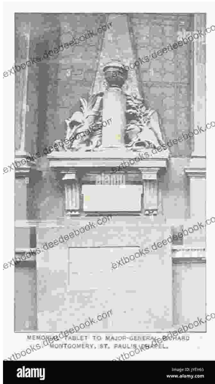
Memorial to General Richard Montgomery in Saint Paul's Church, New York City

General Richard Montgomery's death at the Battle of Quebec sent shockwaves throughout the American colonies. He was mourned as a national hero, and his memory was honored with memorials and statues across the country.