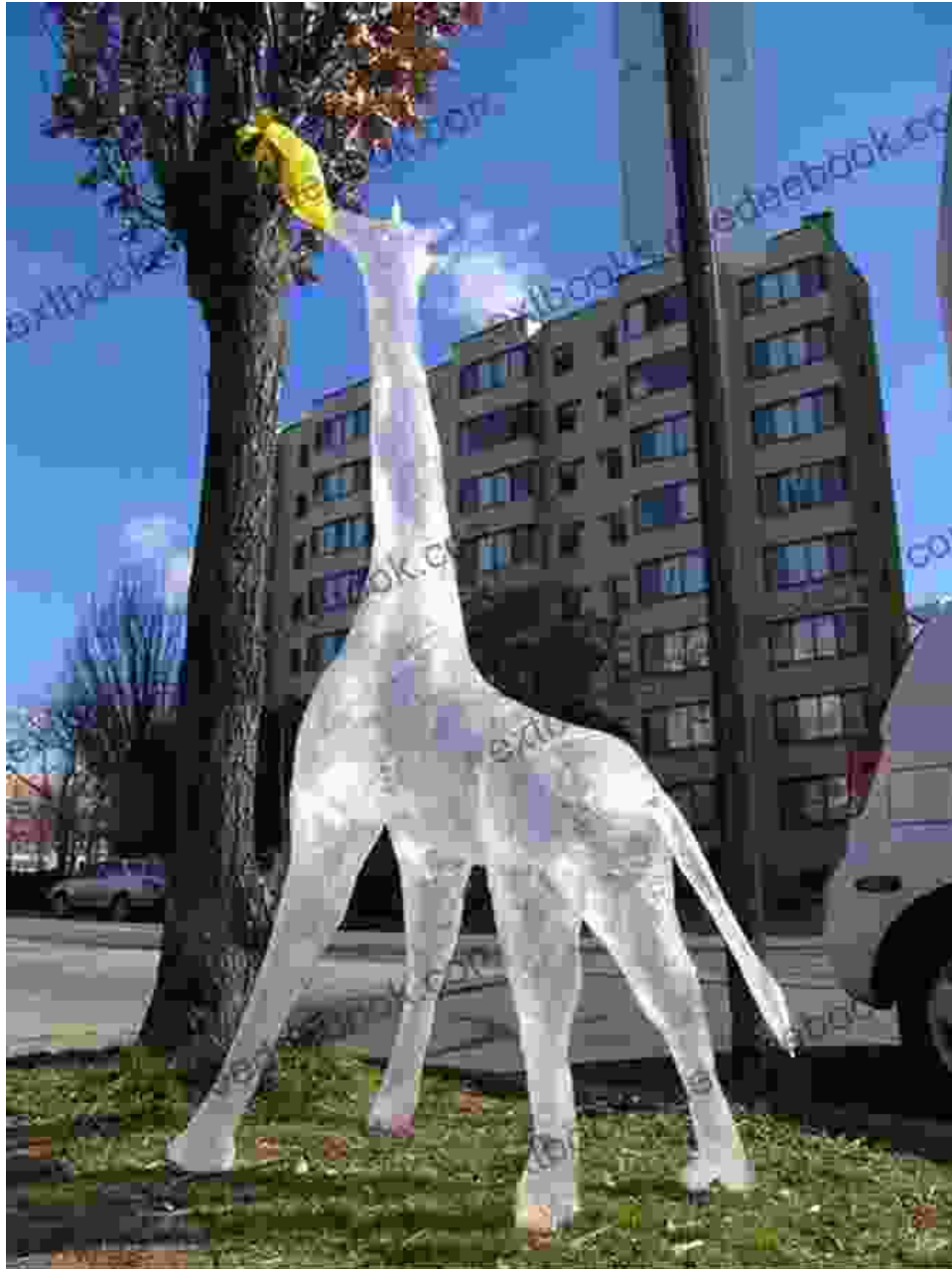
Image Description: A color photograph showcasing one of Roxana Stan's wire and tape sculptures in the middle of a busy city street. The sculpture's abstract form creates a striking visual contrast with the surrounding concrete and asphalt.