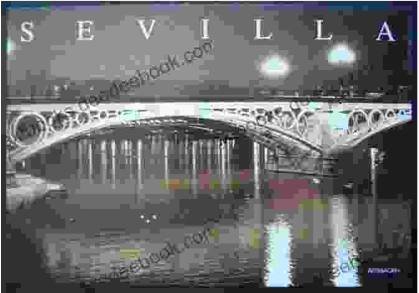
Triana Bridge, a graceful iron bridge spanning the Guadalquivir River, connecting Seville's historic center with the Triana neighborhood.