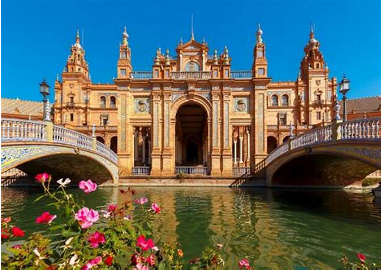
Alcázar of Seville, a majestic Moorish palace showcasing a blend of Islamic and Gothic styles.