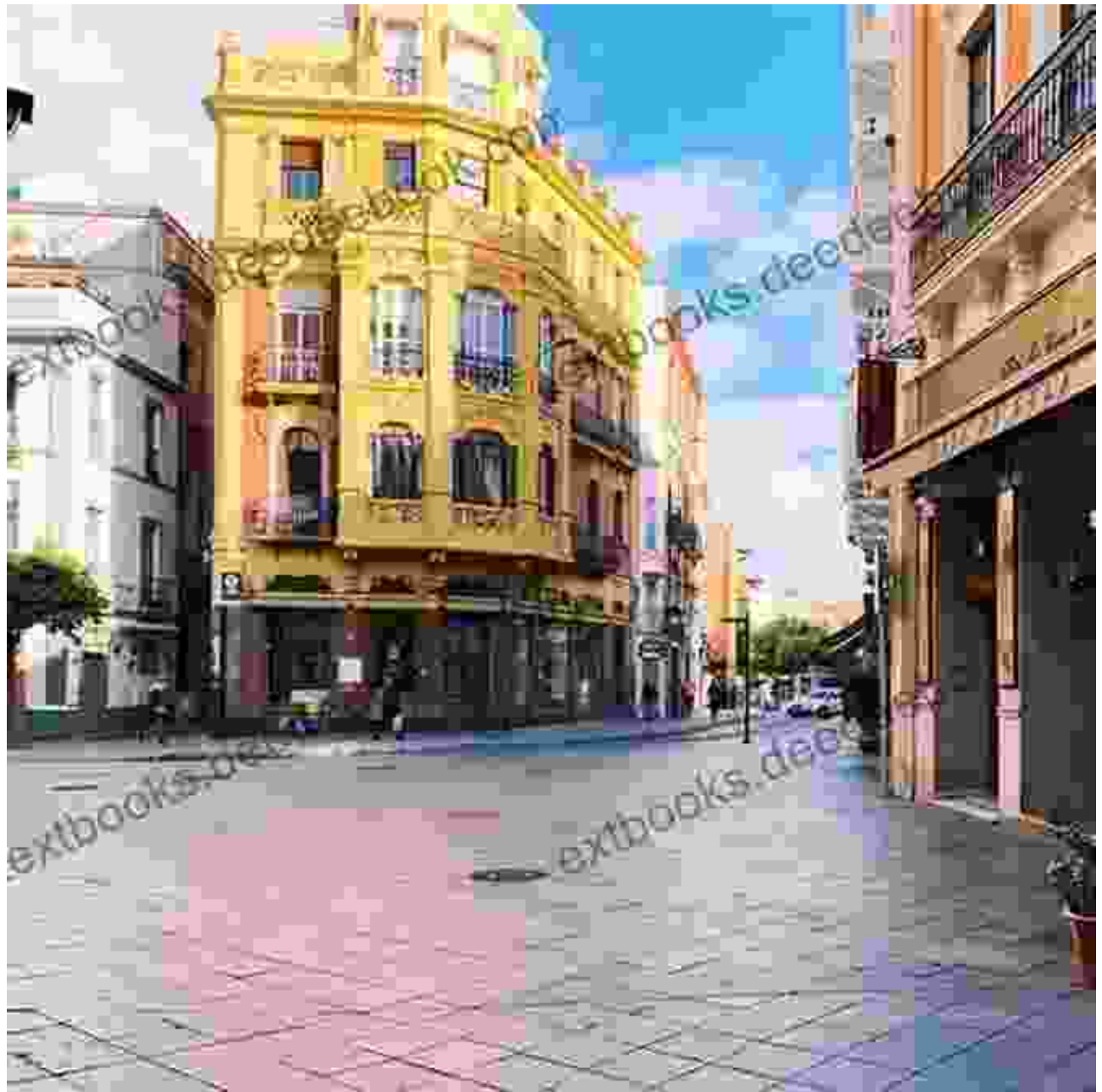
Santa Cruz neighborhood, a quaint labyrinth of narrow streets and charming plazas, steeped in the city's Jewish history.