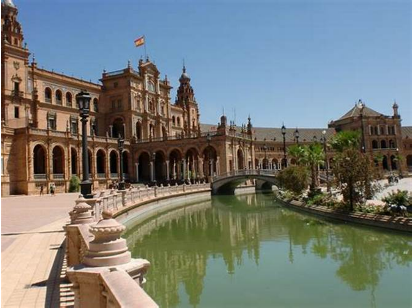
Plaza de España, a stunning semi-circular plaza showcasing Spanish Renaissance architecture.