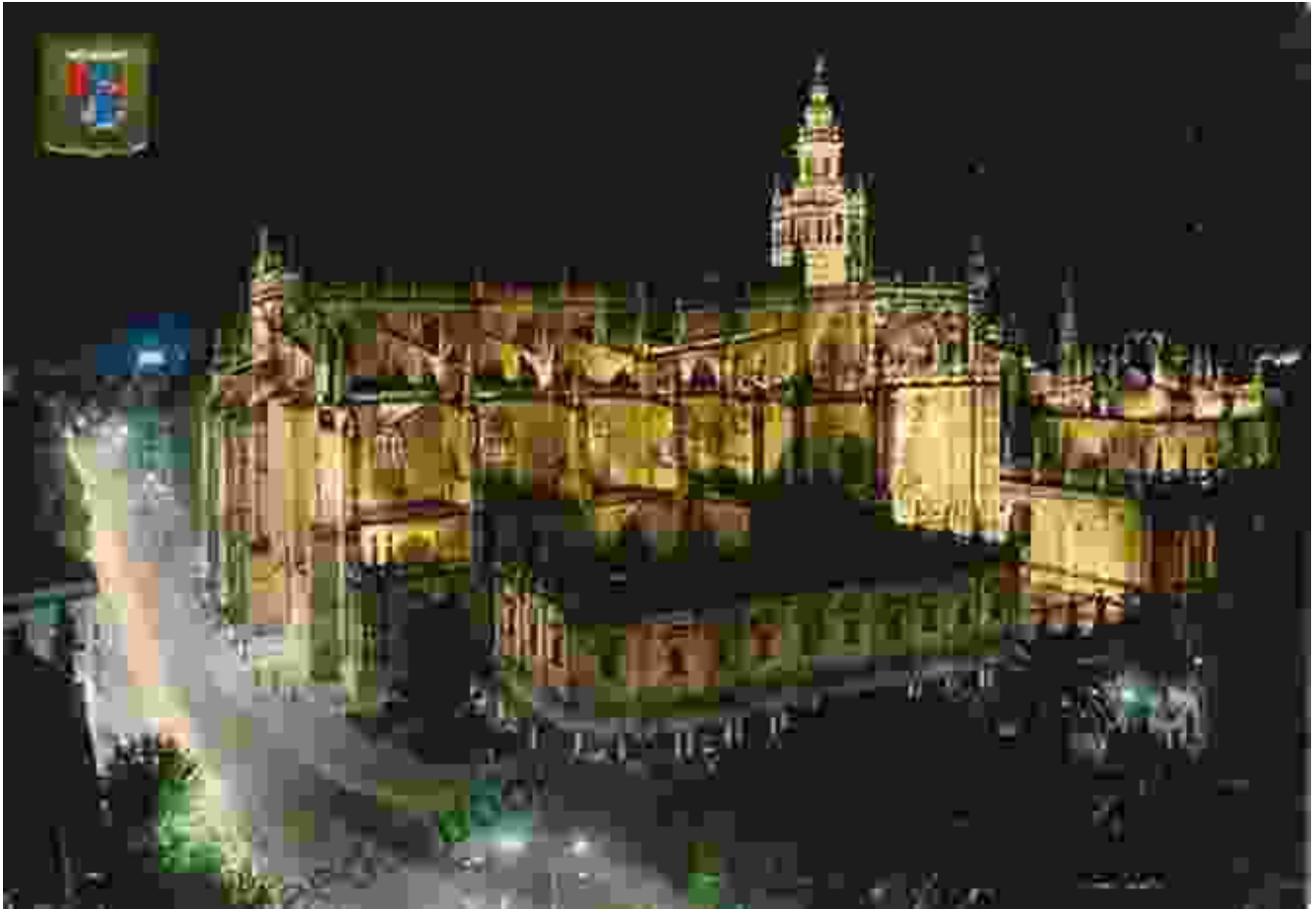
Seville Cathedral, an awe-inspiring Gothic masterpiece adorned with intricate details and soaring spires.