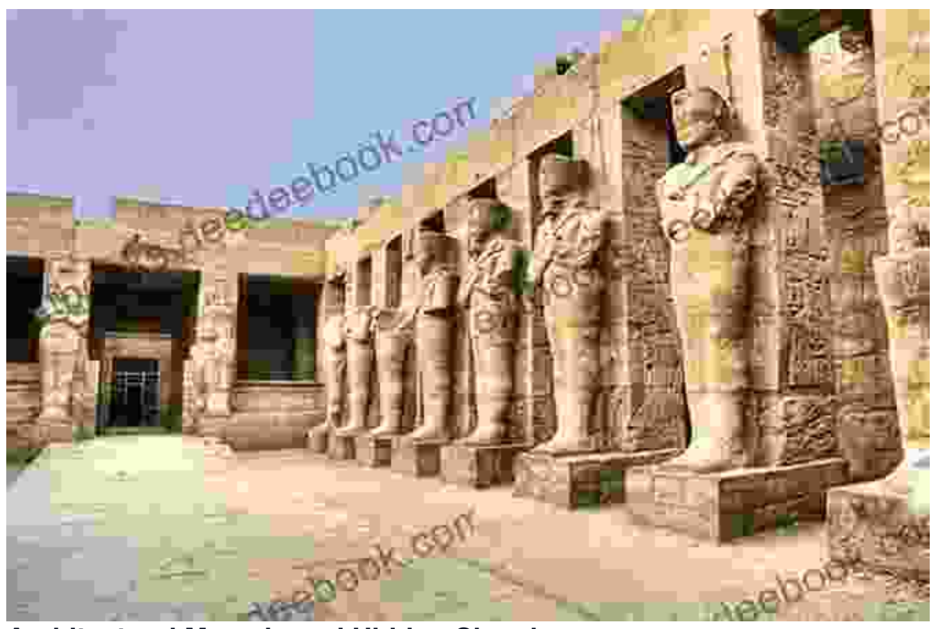
Architectural Marvels and Hidden Chambers

As we venture into the ruins, we are greeted by towering pyramids, intricate temples, and expansive courtyards. The builders of this ancient city possessed an extraordinary understanding of architecture, evident in the precision of their construction and the grandeur of their designs.